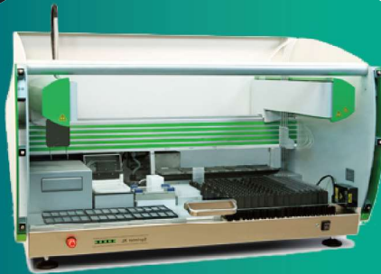
Sprinter XL (IFA+ELISA)