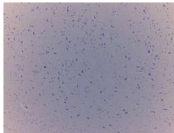
Human Brain Tissue Slide (Adult Normal) Cat# NBP2-77805