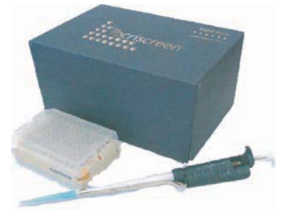
Tocriscreen Plus Targets