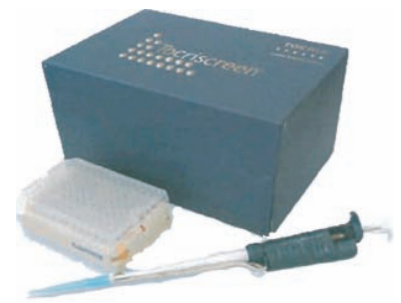
Tocriscreen Plus Targets